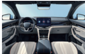
Blue and grey