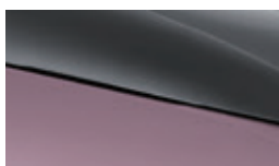
Coral pink + Urban grey