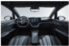
Black and grey