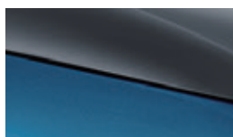
Surfing blue + Urban grey