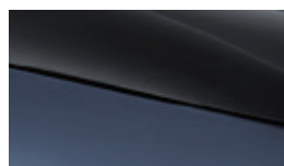
Atlantis grey + Jet black