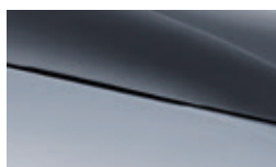
Skiing white + Urban grey